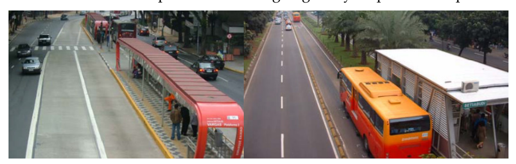
Figure 6-1: Typical BRT systems with bus ways in the median of the roadways (as proposed for Kigali City)

However, the final routes and detailed design for the BRT system will be finalized after the completion of the on-going study on public transport.